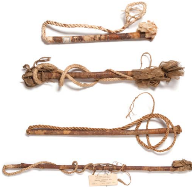
FIG. 3. Lace-bark whips made from branches of the lace-bark tree. The inner woody portion and outer bark have been partially removed and the remaining inner bark twisted into the whip tails. Length of handle, reading from top to bottom: EBC 75996 36 cm; EBC 44946(1) 43 cm; EBC 44946(2) 49 cm; EBC 44956 60 cm.